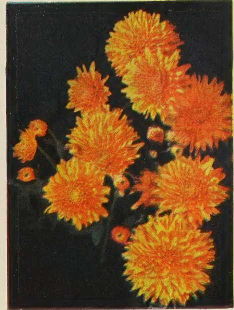
AGLOW. 75c each; 3 for $2.00